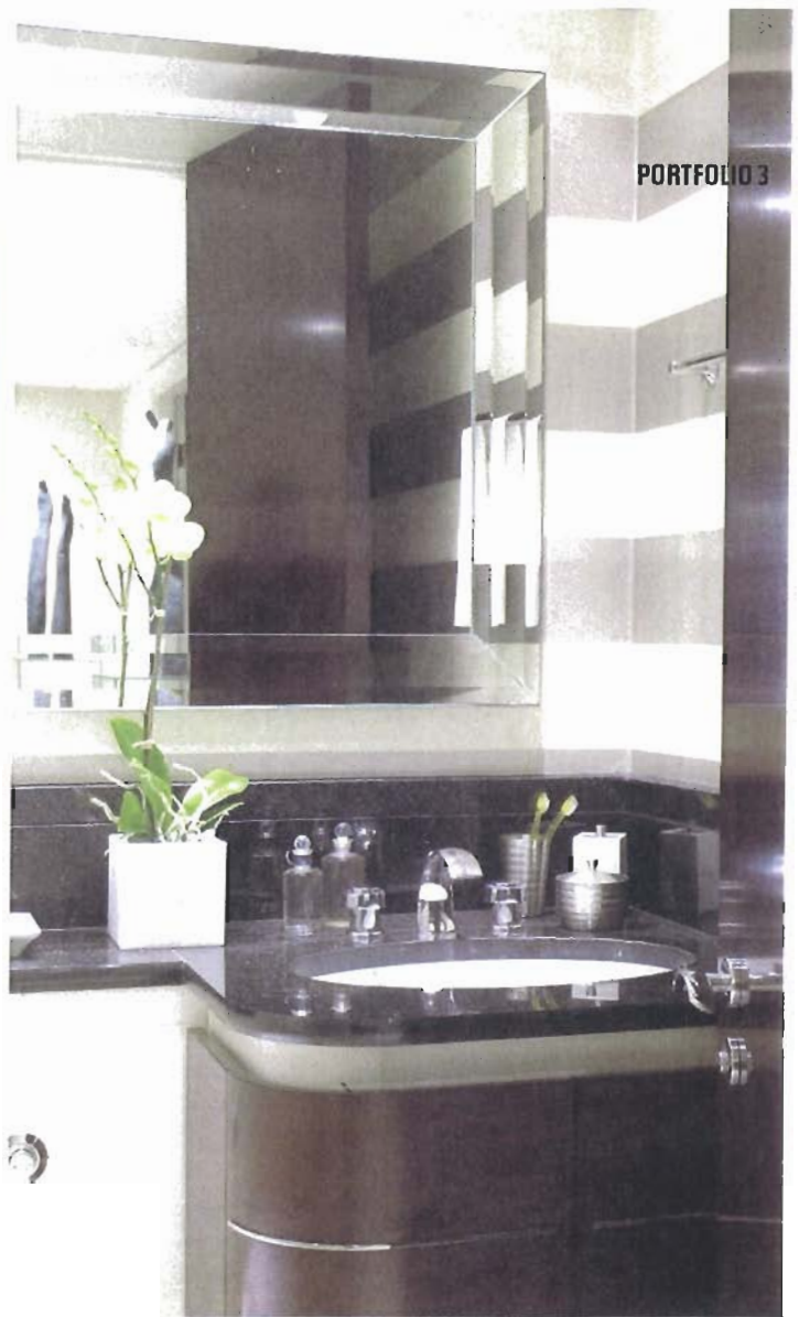
TOP LEFT, A FOUR-POSTER BED IS DRESSED IN SILK AND SATIN FROM THE MONOGRAMMED LINEN COMPANY; TOP RIGHT, GROHE TAPS AND WALLPAPER BY OSBORNE & LITTLE COMPLETE THE GUEST CLOAKROOM; BELOW, THE TWIN BEDROOM FEATURES BULMER & BARROW BEDSIDE TABLES